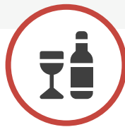
Liquor Store & Bottle Shops