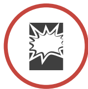
Comic Book Shops